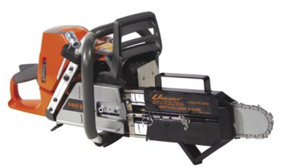
*Shown with optional depth gauge

Univent saws are built from the ground up to withstand the most extreme conditions. They feature an air injected engine, pure-foam air cleaner, high-performance carburetor, stainless-steel muffler-guard plate, solid bar with replaceable tip, and Carbide Chain of America chains. The chains and bar have been specially designed for a more secure connection to significantly diminish side-to-side chain motion and standard anti-kickback features to create a much safer cutting tool.